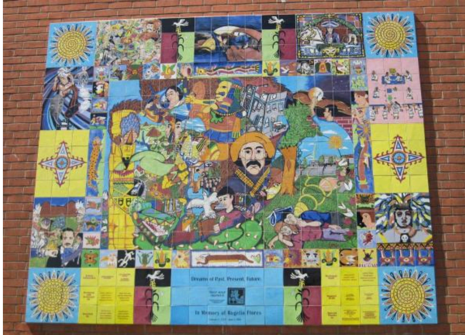
Location: East LA County Hall