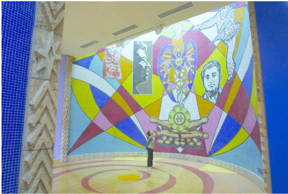
Location: East Los Angeles Library