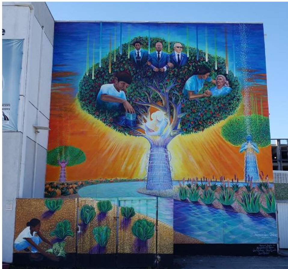
Location: Exodus Recovery Center, MLK Jr. Medical Campus